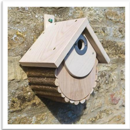
Forest Universal Bird Nest box