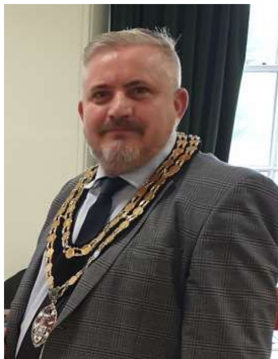
Town Councillor and Royston Mayor 2019-2020

My charities for the year will be the Mayor's Community Trust Fund and the Garden House Hospice in Letchworth.